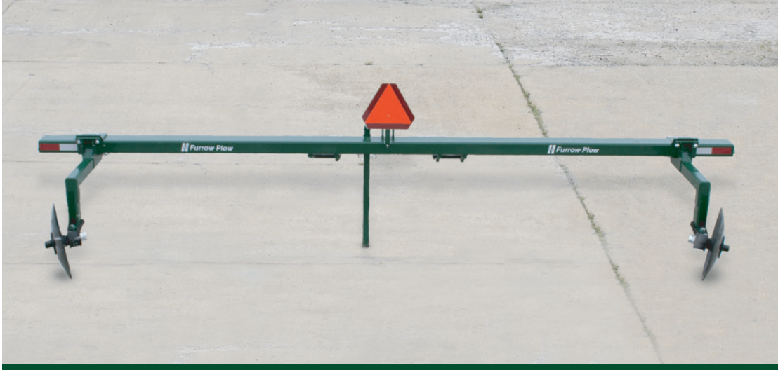
Double Disc Plow